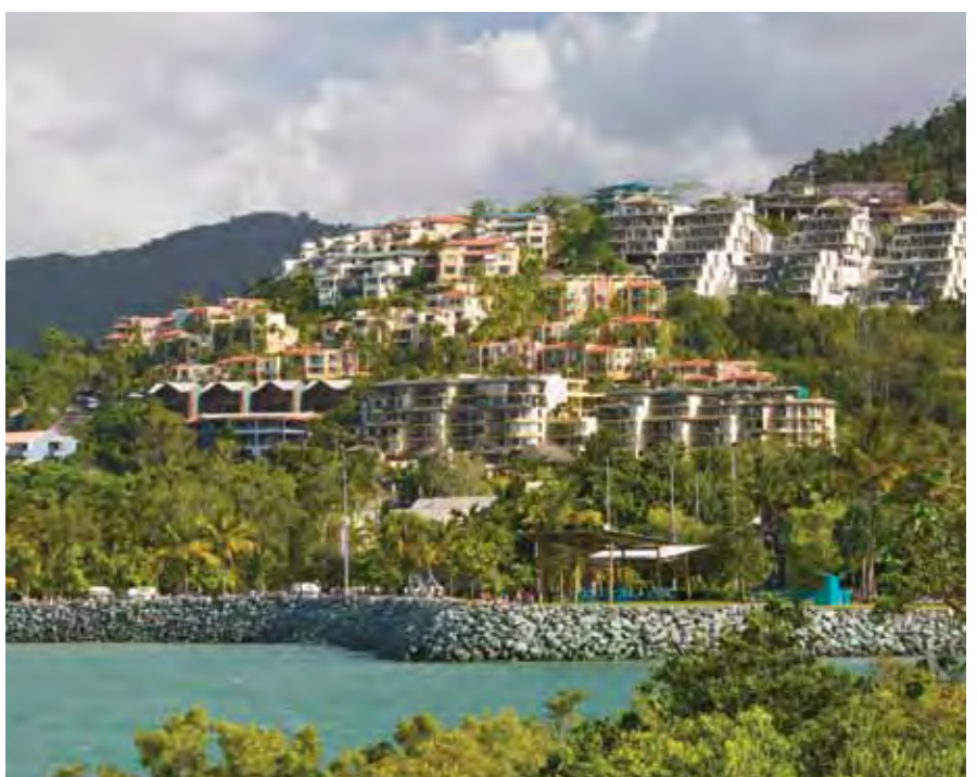
HIGH RISE: Complaints about insurance hikes for units

Soaring insurance costs hit unit owners.