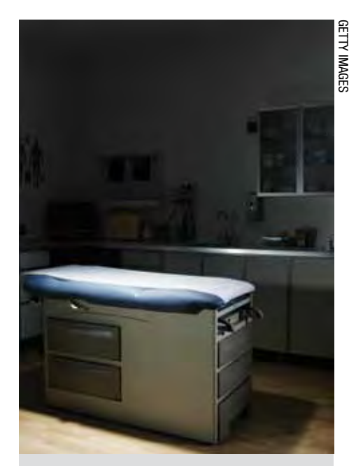
THE DOCTOR IS OUT: Concerns over mobile medicos

www.aph.gov.au/mig jscm@aph.gov.au (02) 6277 4560