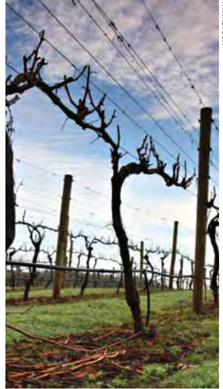
WINE DECLINE: Climate change may affect vintages

Droughts, floods and bushfires are all predicted to increase in frequency and severity, which would be potentially devastating for Tasmania's fragile wilderness ecosystems. •