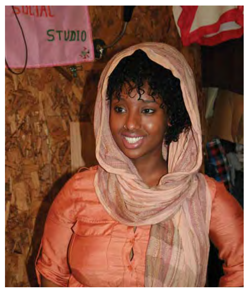
DRESSED FOR SUCCESS: Fashion skills helping new migrants

www.aph.gov.au/em jscem@aph.gov.au (02) 6277 2374