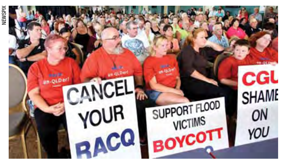
RISING TIDE: Flood victims' anger leads to rethink on insurance rules