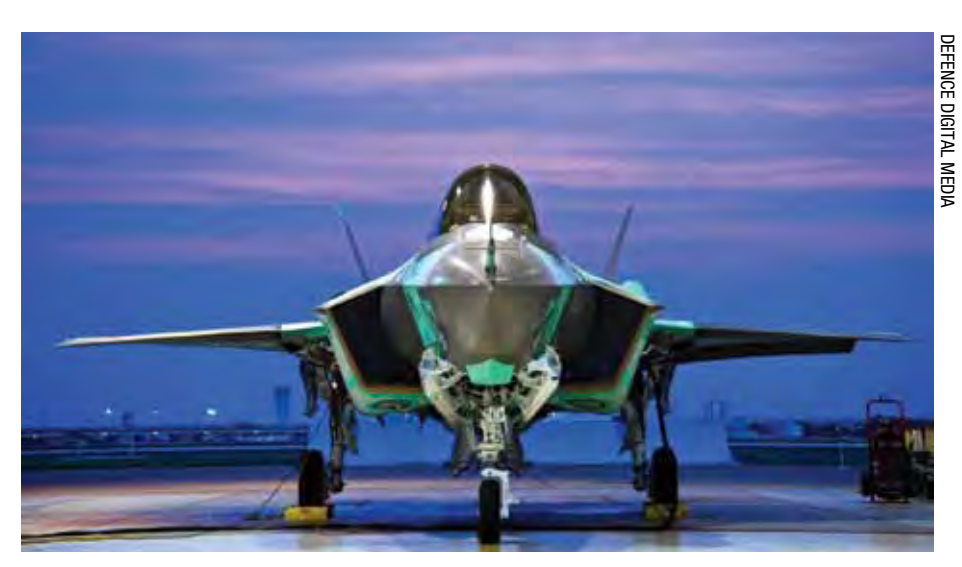
DOG FIGHT: Aircraft performance questioned

Concerns raised over combat capabilities.